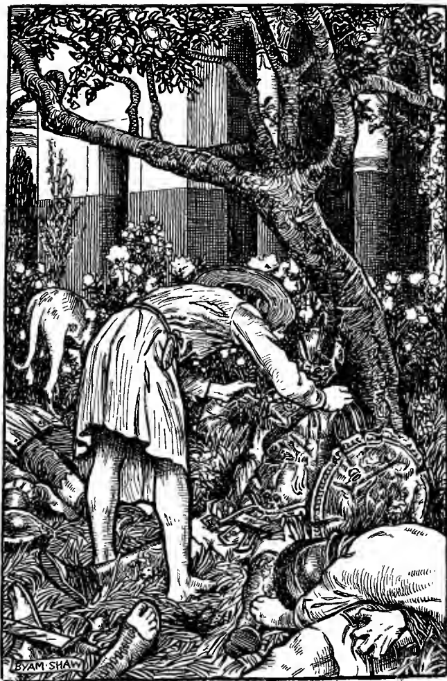
RAPHAEL IN THE GARDEN OF THE VILLA